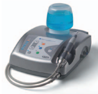
Hu-Friedy Manufacturing Company – www.hufriedy.com

ment and municipal water at the touch of a button. In addition, the Symmetry IQ 4000 offers an auto-purge feature that simplifies