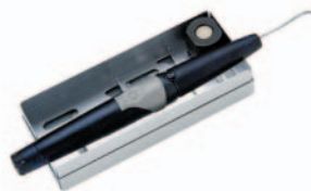
Dentsply Professional – www.cariesid.com

This addition to minimally invasive dental caries detection has a claimed detection rate of 92% for occlusal caries and 80% of interproximal caries and functions in a wet field. Audible and visual alerts will signal caries suspected areas. This lightweight device is autoclavable with low energy