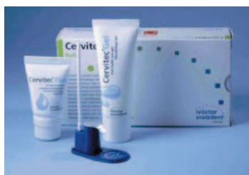
Ivoclar Vivadent North America – www.ivoclarvivadent.us

patients, or to prevent transmission between family members.