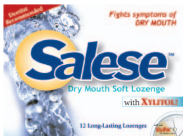
Nurova – www.nurovainc.com

Salese is a slow dissolving soft lozenge that delivers essential oils and other beneficial ingredients (including xylitol & zinc) to improve oral hygiene and fight the symptoms of dry mouth patients. Salese is a sustained release product that delivers active ingredi-