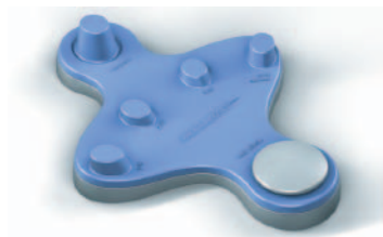
Dental R.A.T. – www.dentalrat.com

If you haven't heard or seen the Dental R.A.T you are in for a treat. The Dental R.A.T. is a simple and powerful tool for streamlining your computerized periodontal charting. It works with your current dental software. The Dental R.A.T is a simple foot-operated mouse that enables the most effective,