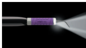
Discus Dental – www.discusdental.com

The InSight LED ultrasonic scaler insert is the latest innovation in powered scaling which 'lights' the way with circular dual-LED illumination and is designed to maximize scaling efficiency and effectiveness. The bright LED improves