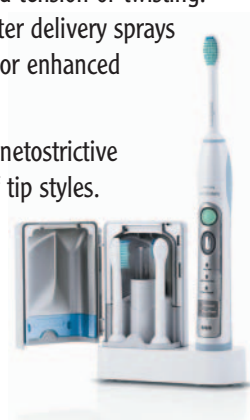
Philips/Sonicare – www.sonicare.com

FlexCare is the ultimate in sonic toothbrush innovations from the makers of Sonicare – this brush redefines 'clean'. The FlexCare includes Clean, Sensitive and Massage modes to meet the specific needs of the individual user.