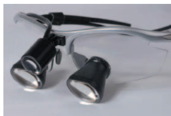
Ultralight Optics – www.ultralightoptics.com

Lightest and smallest LED loupe light on the market means maximum comfort and style. 1/3 the weight of its competitors! It weighs only