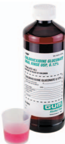
Sunstar Americas – www.sunstaramericas.com

Alcohol-free Chlorhexidine Gluconate Oral Rinse USP, 0.12% from GUM® helps all your patients gain from their gingivitis treatment – without alcohol.